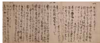
Dream Diary ( Yume no ki ). By Myōe.

This exhibition features the priest Myōe (1173-1232), who revived Kōsan-ji Temple in Togano-o, Kyoto in the Kamakura period, and focuses particularly on the vast records of his dreams known as Yume no ki . National Treasure artworks Chōju Giga , a set of four scrolls of “frolicking animals,” are also presented.