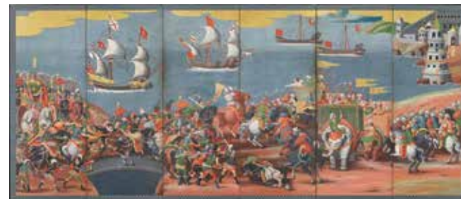
Battle of Lepanto and Map of the World (the right-hand screen)

Saturday, October 12 – Sunday, December 8, 2019