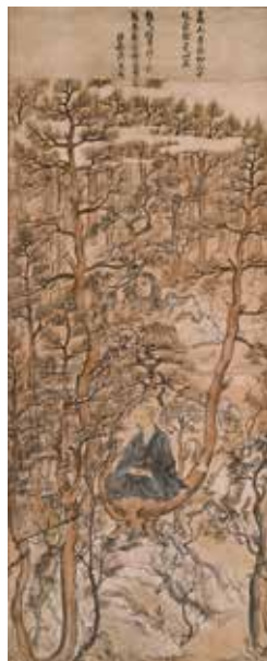
Portrait of Priest Myōe (meditating in a tree)