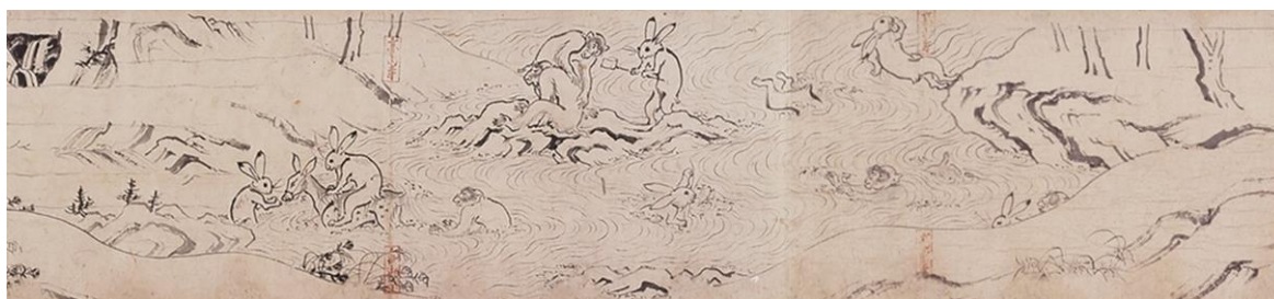
National Treasure Scroll of Frolicking Animals (J. Chōjū giga ), Volume 1 Heian period, 12th century