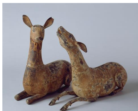
Important Cultural Property Sacred Deer Kamakura period, 13th century