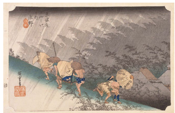
Shōno: Driving Rain, from the series Fifty-three Stations of the Tōkaidō Road

By UTAGAWA Hiroshige, Edo period, 19 th century Edo-Tokyo Museum