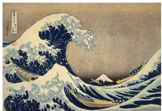
Under the Wave off Kanagawa, also known as the Great Wave, from the series Thirty-six Views of Mount Fuji

By KATSUSHIKA Hokusai, Edo period, 19 th century Edo-Tokyo Museum