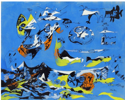
Blue (Moby Dick) Jackson Pollock, 1912