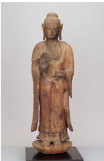
Important Cultural Property Standing Bhaiṣajyaguru Heian period, 9th century Kosetsu Museum