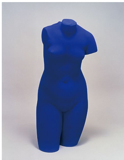
Blue Venus Yves Klein, 1962