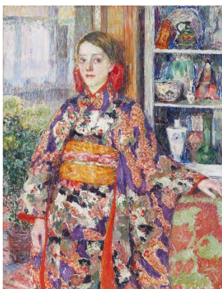
Belgian Girl in Kimono