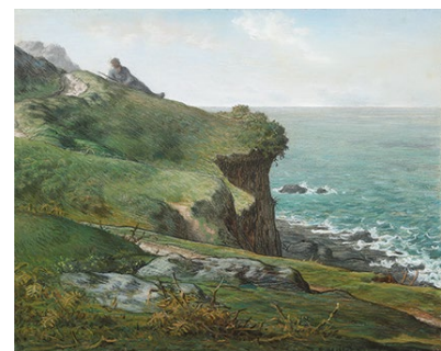
Cliffs of Gréville